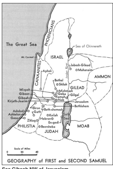
See Gibeah NW of Jerusalem